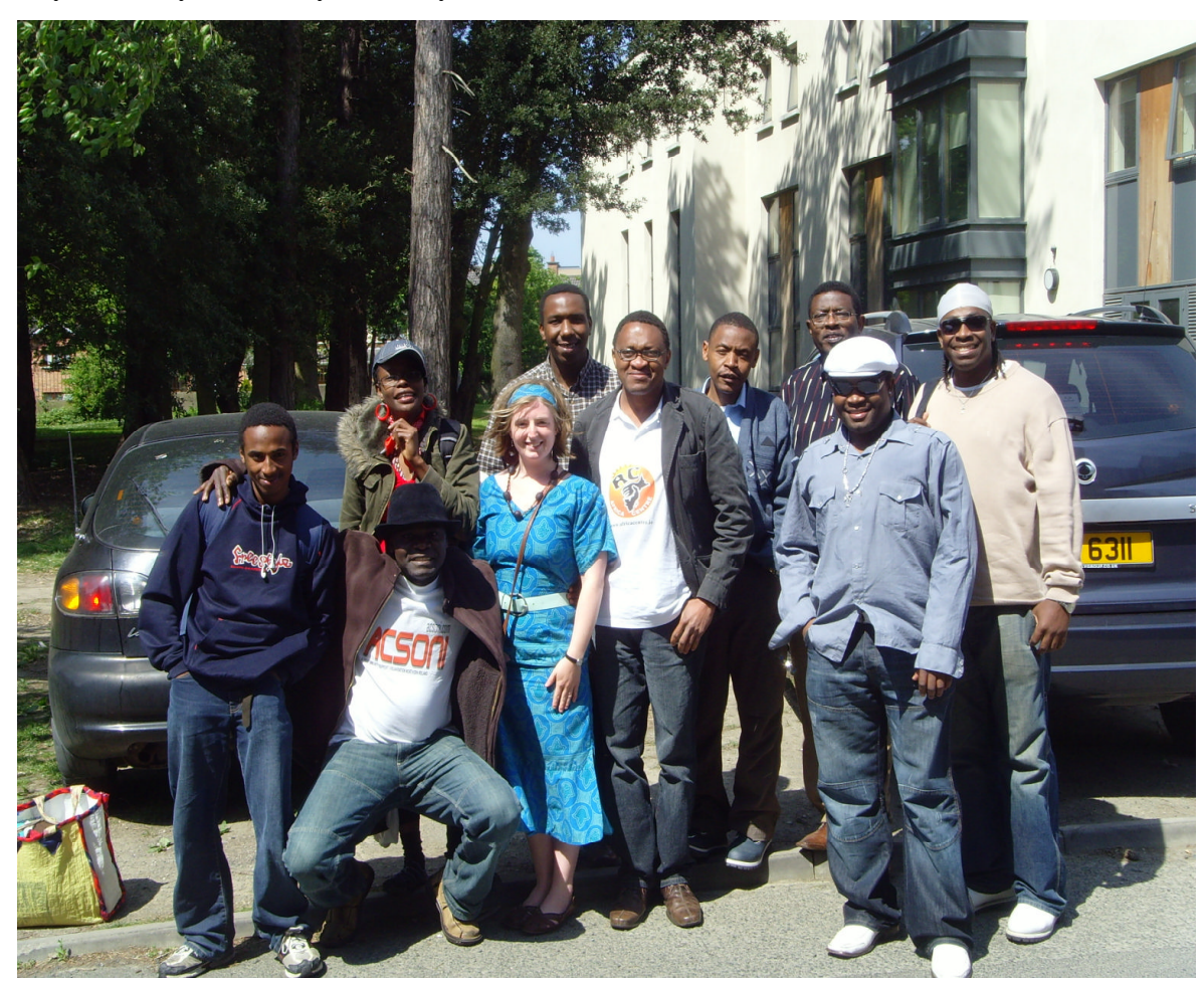
ACSONI upon their arrival in Dublin

The above project is a cross border cooperation initiative, funded by Cooperation Ireland. This project involved the Africa Centre in Dublin, and the Afro-Community Support Organisation in Northern Ireland, (ACSONI), from Belfast. The project was in two parts, the first being a trip from ACSONI members to Dublin and the second part being a reciprocal visit from the Africa Centre to Belfast. The first visit took place from Friday 23<sup>rd</sup> May to Sunday 26<sup>th</sup> May, in Dublin.