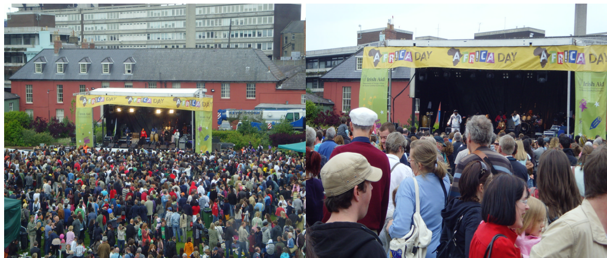
Africa Day celebration in Dublin Castle

Our guests from Belfast departed later that evening after attending the family day.