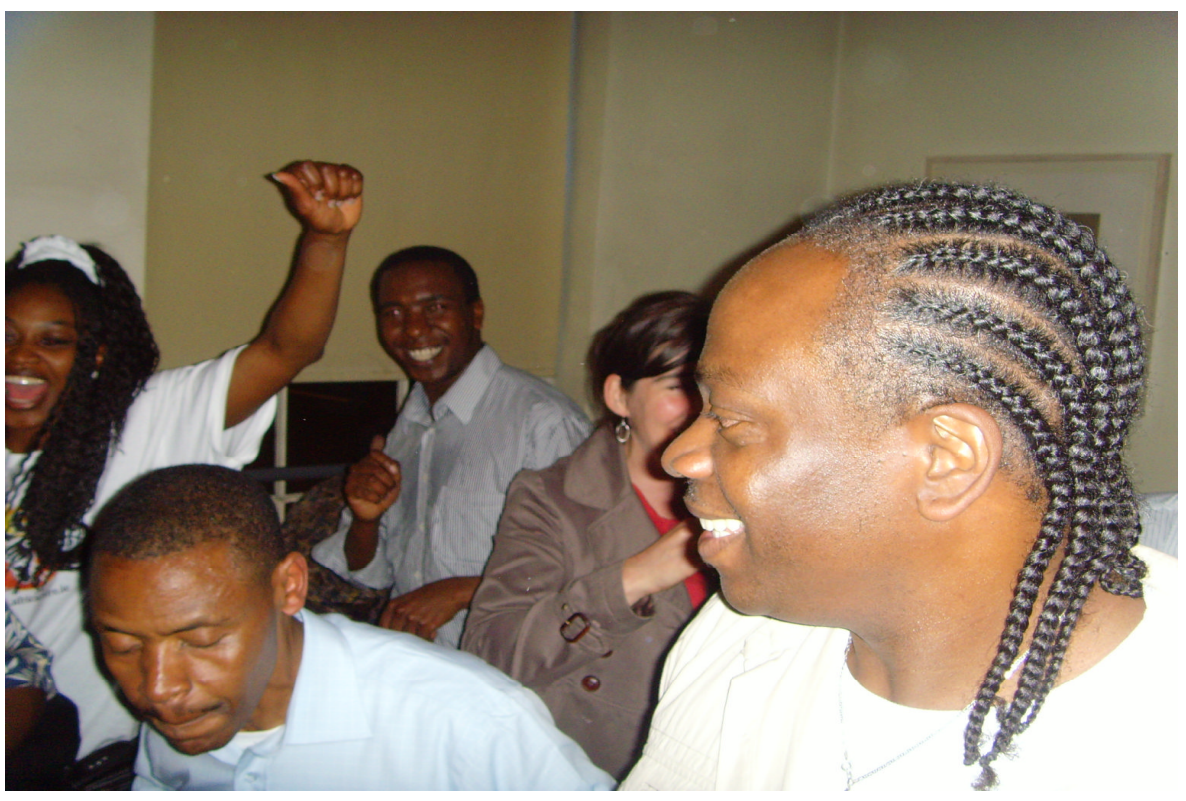
A taste of nightlife in Dublin

This was followed by a dinner/reception at an African restaurant in the Dublin city area. Later that evening, ACSONI was taken round the city of Dublin to see what night life was like, among the immigrant community in Dublin.